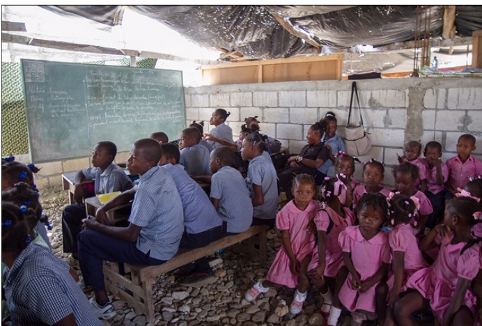
Classroom converted to an exam area in a one-day mobile clinic near Hinche