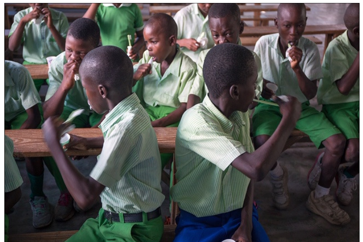
A group demonstration of oral hygiene before fluoride treatments.